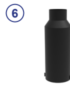
⑥ Round bell