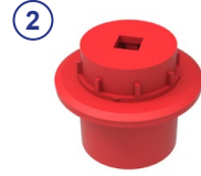
② Centring cap