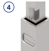
④ Transport lock