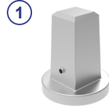
① Square cap SQ27/32