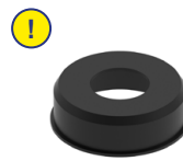
⑨ Bell adapter (optional)