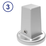
Square cap SQ27/32