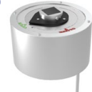
Optional: Mechanical position indicator made of stainless steel